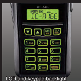
LCD and keypad backlight