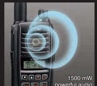
1500 mW powerful audio